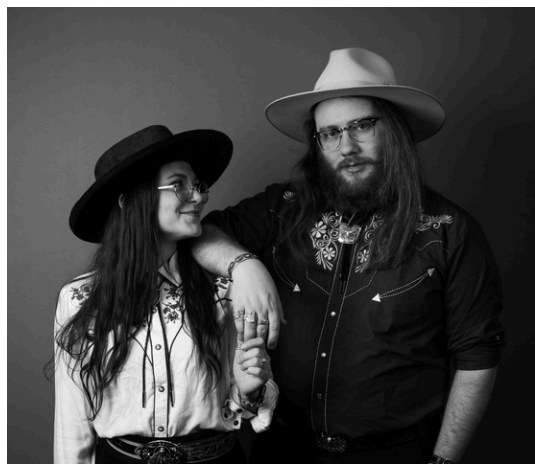
The Hen and the Crow