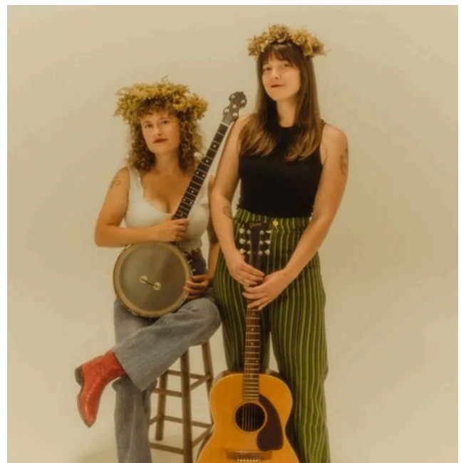
The Montvales

The Montvales: Check out "Loud and Clear", our latest single with Free Dirt Records!